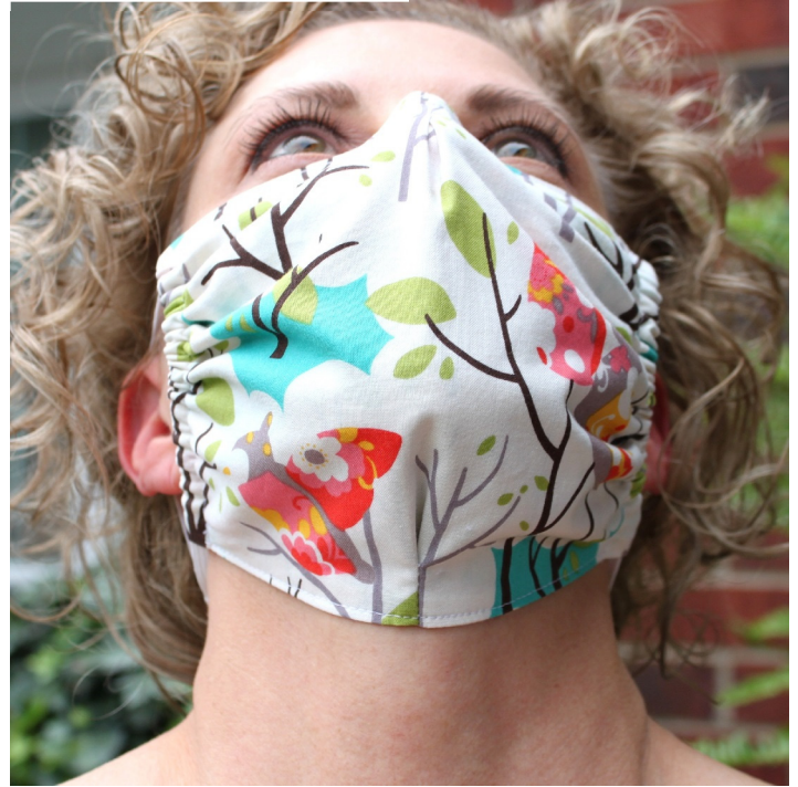
PDF Pattern 3 sizes with elastic loop or ties