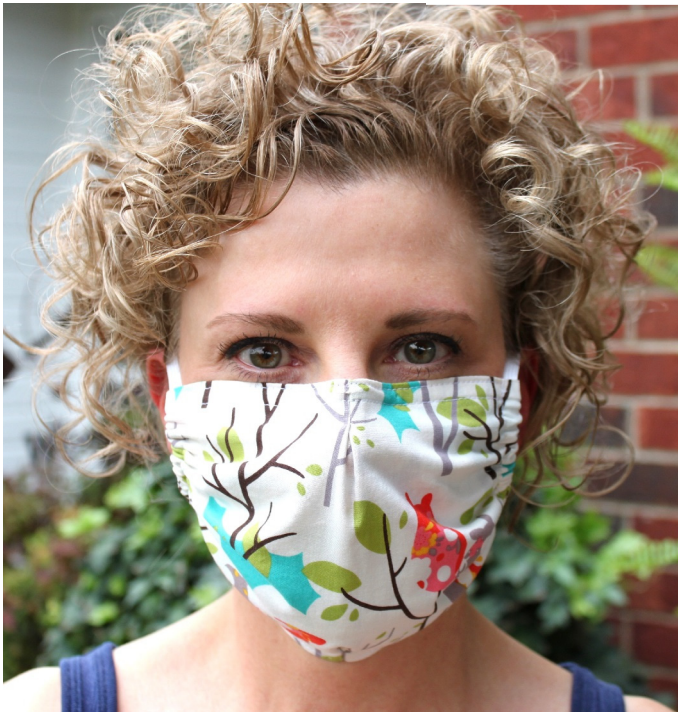
Multipurpose Face Mask